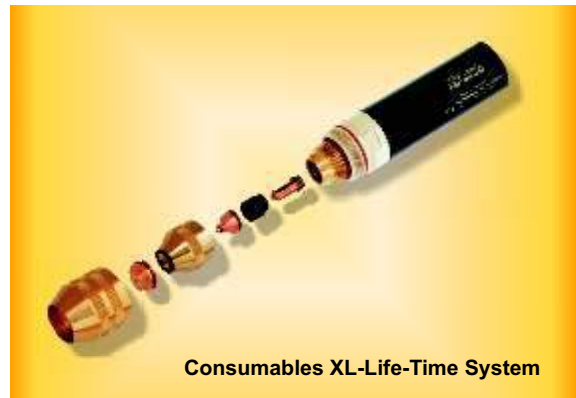
Consumables XL-Life-Time System

The high performance capacity of the plasma torch PerCut 80 ensures in connection with the heavy duty XL-Life-Time system and its longevity of cathodes and nozzles (up to 1,200 piercings with edge squareness still below 3°) lowest costs on consumables and minimized downtimes . The technical conditions for the high productivity of the plasma cutting process are optimized operational parts of the beam generation system interacting with microprocessor controlled sequences.