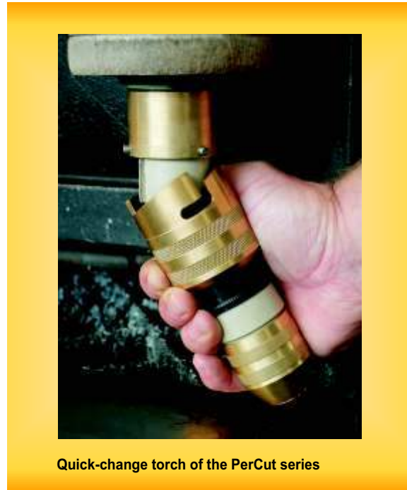
Quick-change torch of the PerCut series