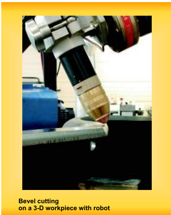
Bevel cutting on a 3-D workpiece with robot

For the moment this unique plasma cutting unit with HiFocus PLUS technology will be offered in this performance class for the plasma gases oxygen and air. Because of the outstanding price-performance ratio especially the medium sized industry now is in the position to compete on the market with high-class cutting work.